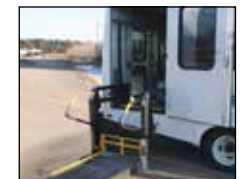
Rear Wheelchair Lift