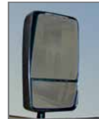
Breakaway Convex Mirrors

Due to constant product improvements; specifications, component parts and optional equipment are subject to change without notice or obligation. See your dealer for details. Photos may show optional equipment.