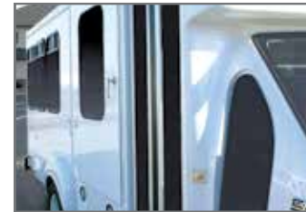
High Gloss Exterior Fiberglass