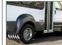
Painted Skirts and Blacked Out Windows