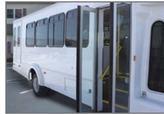
High Gloss Exterior Fiberglass