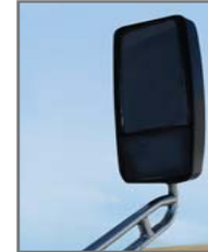
Breakaway Convex Mirrors