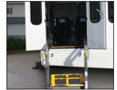
Rear Wheel Chair Lift