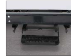
Rear Step & Tow Hooks