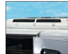
Rooftop Mounted AC