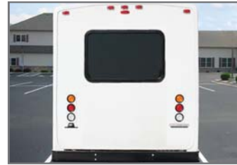
Rear Window (shown with optional light package)