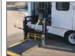
Rear Wheel Chair Lift