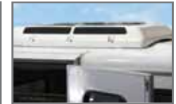
Rooftop Mounted AC