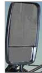
Breakaway Convex Mirrors