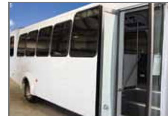
High Gloss Exterior Fiberglass